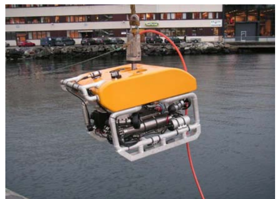
Latching mechanism for ease of deployment and recovery

SBec Marine Pty Ltd Trading as SBec ABN 45 062 518 192