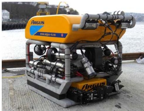
500msw Rover 54 Inspection ROV